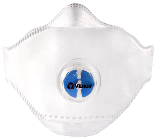
Beetle V-1110 V, Beetle V-1120 V