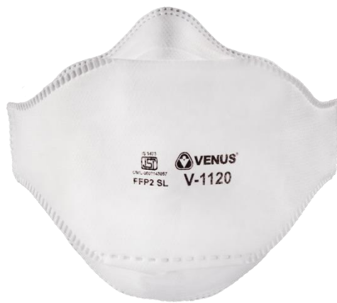
Beetle V-1110, Beetle V-1120