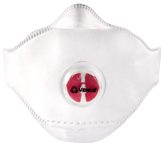
Beetle V-1130 V