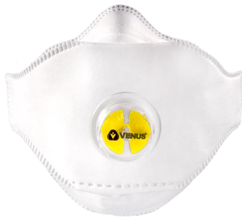
Beetle V-1110 V, Beetle V-1120 V